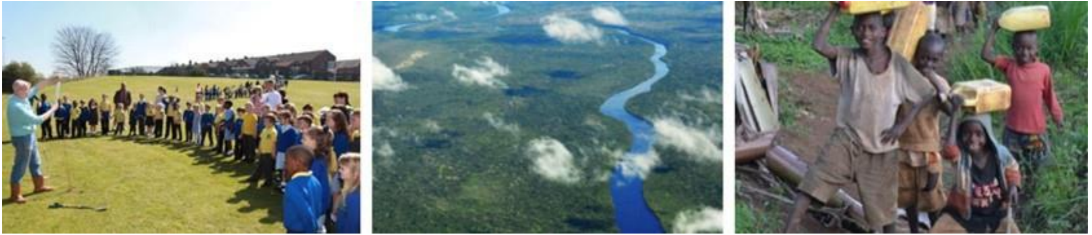
Sample Carbon Offsetting Projects - Tree Planting - Amazon Avoided Deforestation, Brazil - Clean Water projects